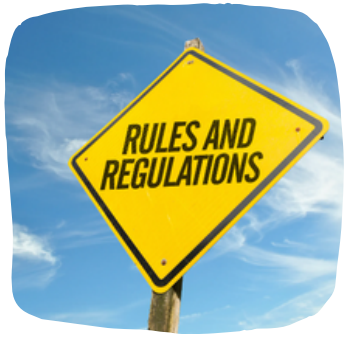
How will the QBCC regulate Trusts?