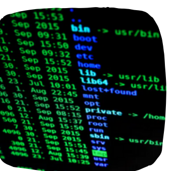
Enormous Brother is Watching