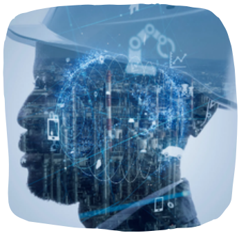
Insights can be a contractor's nemesis or friend