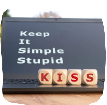
Project Trusts in the construction industry - The KISS Method