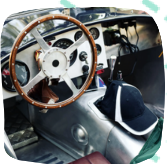
Licensing is not a cure for the ills of the construction industry. It also cannot be an inapt 'handbrake' on work and business opportunities.