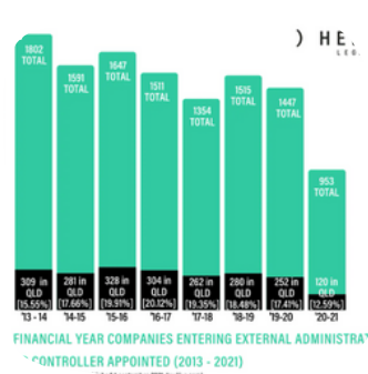
Are Trusts the cure?