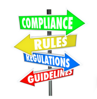
Building Businesses: Let's talk about how the QBCC is regulating the building industry