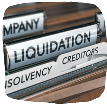
Anti phoenix licensing provisions 'net' cast too wide