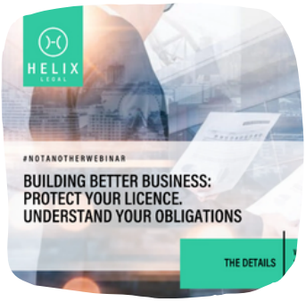
QBCC regulation of the construction industry. Strategies and initiatives