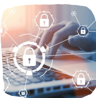
A 'ballpark swing' on how the QBCC will regulate SOP in 2022