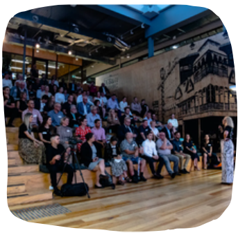
Legislative contract reforms are MIA