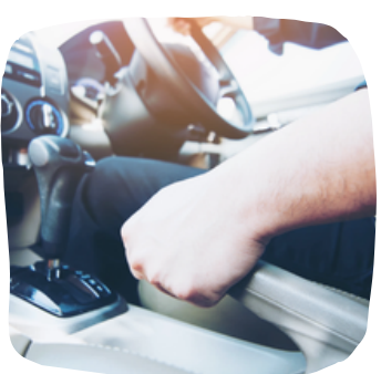
Section 42E will be a 'hand brake' in resolving domestic building disputes