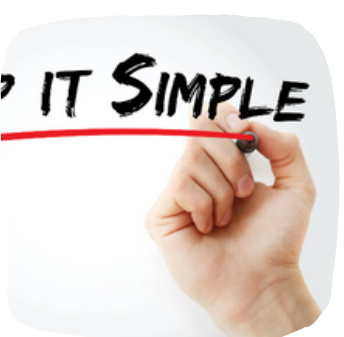
When is a Project Trust required? - The KISS Method Part 2