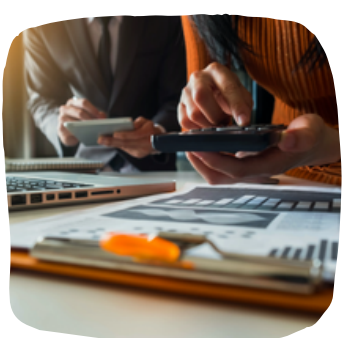
New annual reporting challenges for contractors and the QBCC