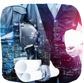
Let's support the future of adjudication