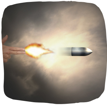
"An effective licensing regime is not a silver bullet for the problems of the industry " .....but we must have one